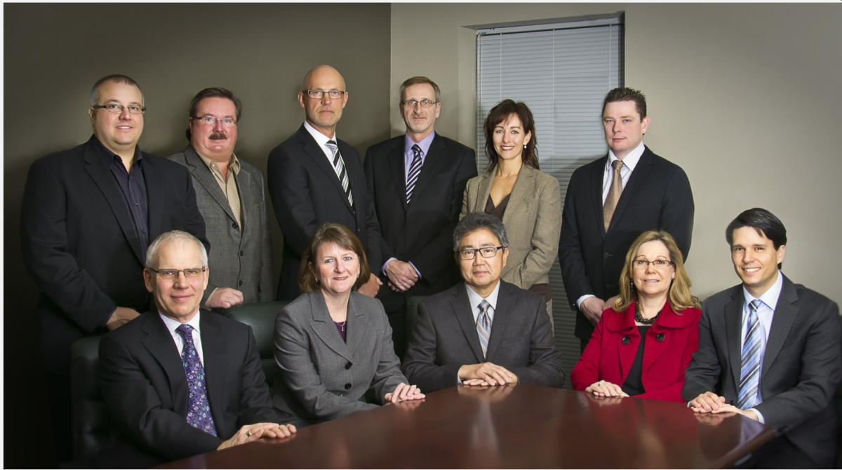
2012 Board of Directors